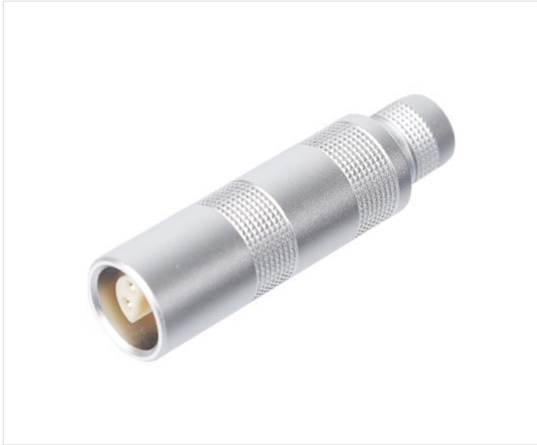
■ Cable collet