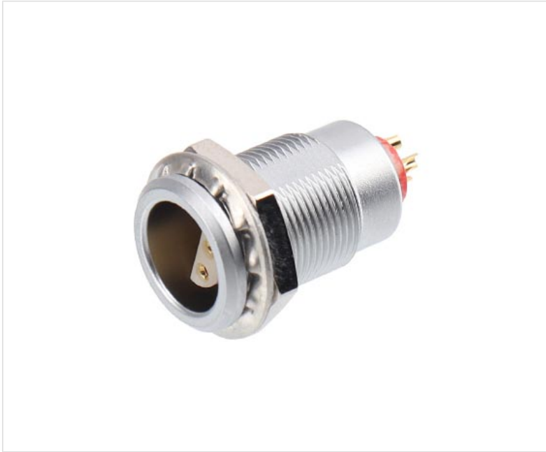
■ Nut fixed